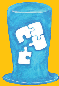
The Blue Hat managing the thinking process